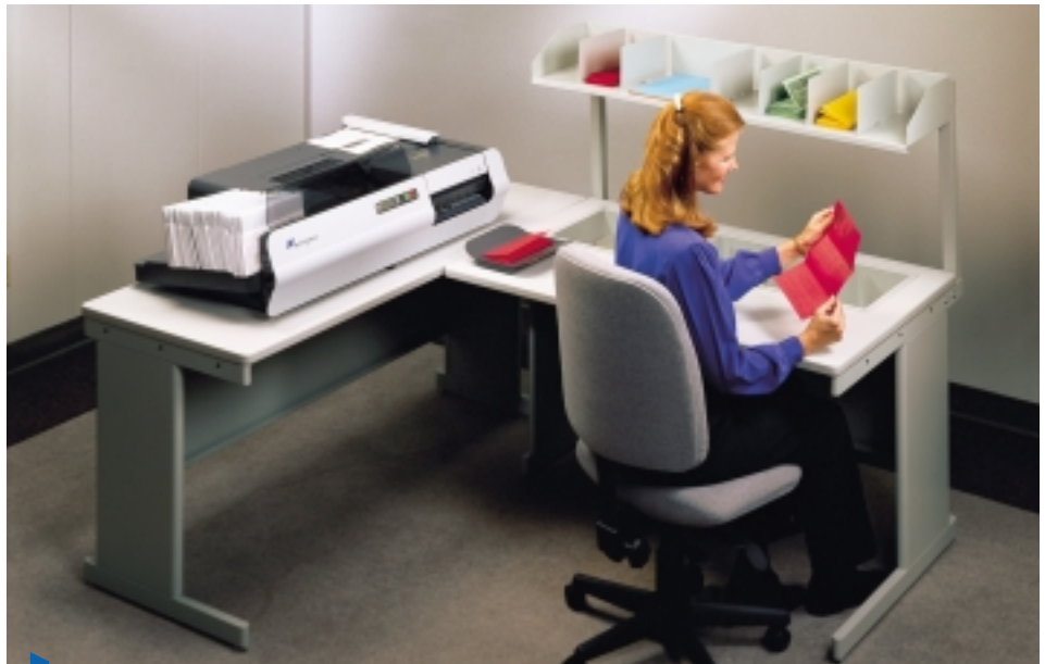
Ergonomically designed workstation and chair available (conveyer not shown, also available).